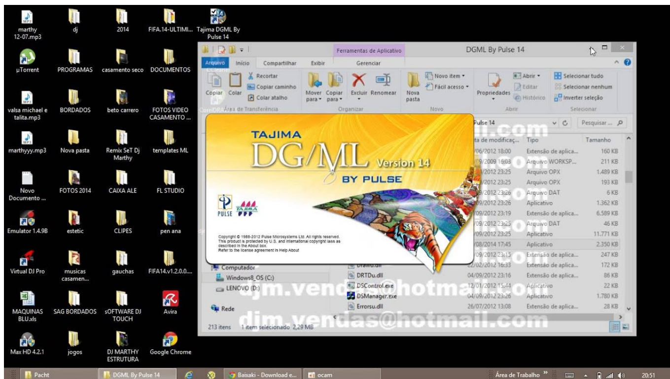
Tajima DGML By Pulse Version 14.1.2.5371.rar