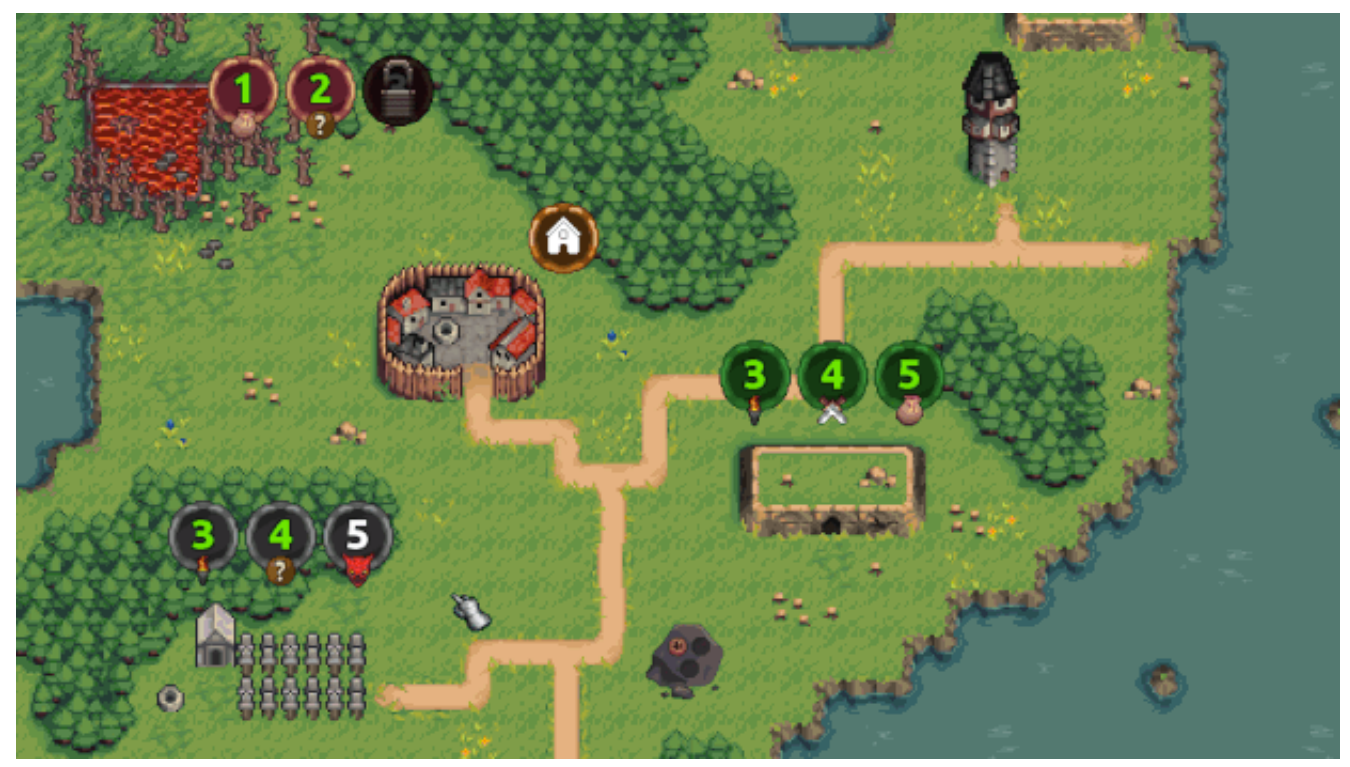
Explore three unique zones and conquer the World of Mystery.