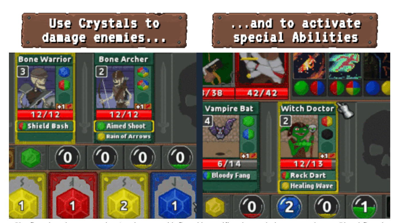
Use Crystals to damage enemies. Attack enemy with Crystal in specific colour to deal even more damage. Played Crystal generates Aura in corresponding colour. Use generated Auras to activate Abilities of your Heroes.

based on the deck with Crystals in five colours.